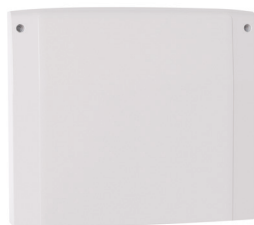
Grade 2 Hybrid Control Panels - Blank Endstations