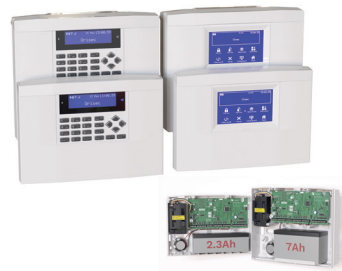
Grade 2 Hybrid Control Panels - On Board Keypads