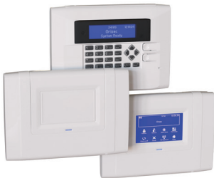
Wireless Control Panels