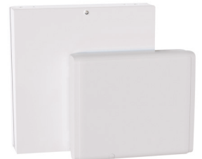
Grade 3 Control Panels